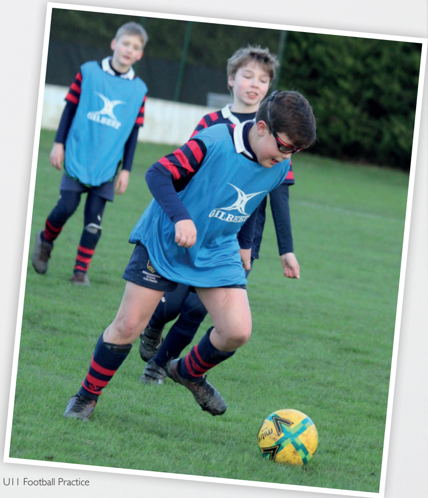
U11 Football Practice

The U9A&Bs took on Cheltenham College on Wednesday in our first encounter of the season. From the outset the As looked in complete control, leading by 3-0 after the first 10 minutes. They continued their attack and created an endless number of chances for themselves to score. The rotation of attack and defence worked at times seamlessly and four more well taken goals in the second half of the game ensured a comfortable 7-1 win. The Bs were equally creative in attack and albeit camped out in the Cheltenham defence with wave after wave of attacks on the opposing team's penalty area. Not to be outdone by the As they too scored seven goals in an excellent 7-2 win. Well done to both teams for getting Berky off to such a great start to the season. SM