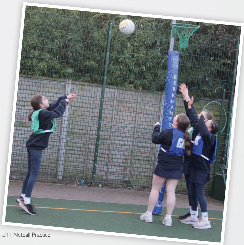
U11 Netball Practice

These were the first matches of the season for the U10 girls, and they certainly didn't disappoint! With two wins and one narrow loss, the girls should all be pleased with their opening matches. Mr Parker was watching two matches, and all the girls were keen to play well. They successfully managed the strict rotations of Bee Netball, (every quarter; the girls change positions) and all girls were able to try shooting. It was a freezing afternoon, and I was very impressed that all the girls played with enthusiasm, despite their icy fingers! Both these matches were closely contested - a 5-3 win and a 4-3 loss. The match I was umpiring was slightly different as the Berky girls dominated throughout. It really didn't matter where the girls played, they passed the ball with confidence and used the space wisely around the court, finishing with a 12-3 win. A super start to the season! Well done, ladies! JH