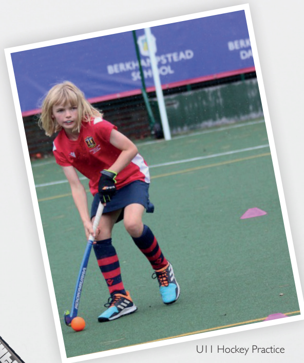
U11 Hockey Practice

On a very soggy and wet afternoon, the girls shone. Our goalkeeping was fantastic today with many shots on target being saved – brilliant! All three teams played their hearts out in atrocious conditions and were a credit to the school. Our training sessions on the astro at Plock Court are certainly paying off, as the girls passed the ball into spaces with confidence. The red team narrowly lost 1-0, the blue team won 2-1 and the gold team lost 2-0. Well done, girls! LVV