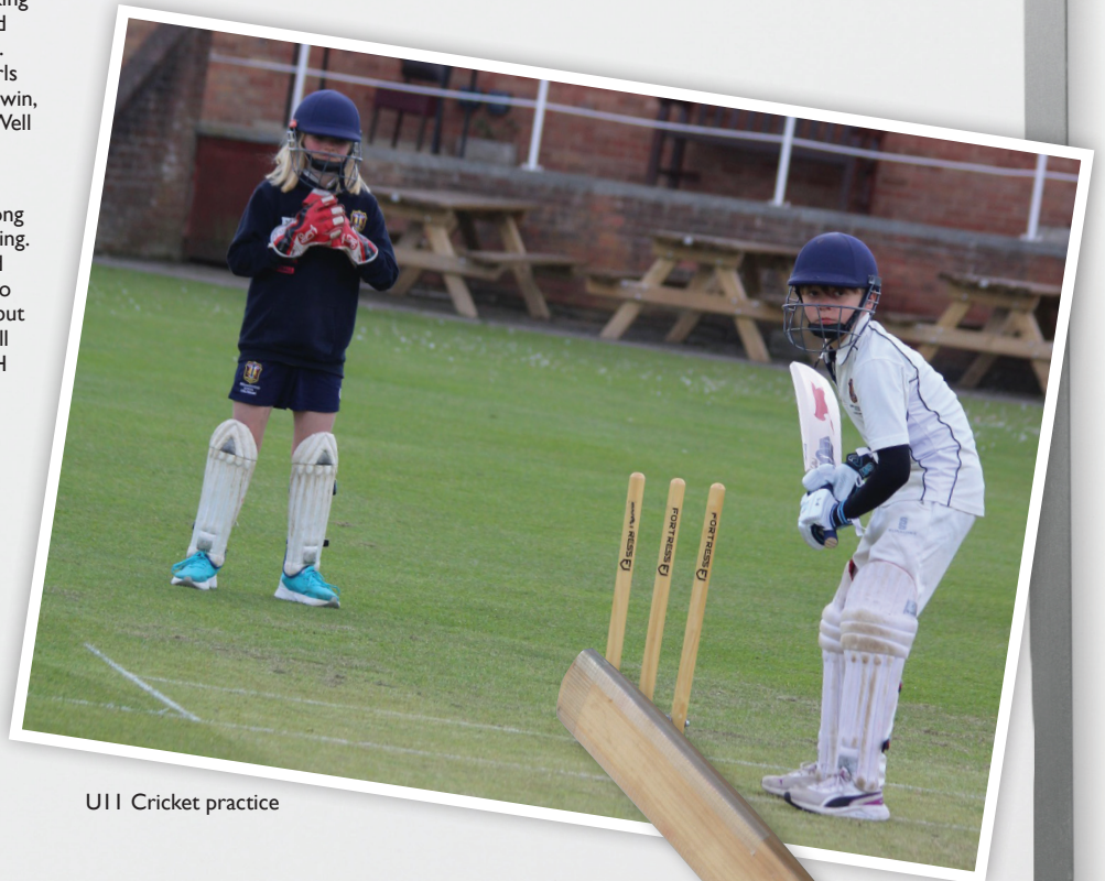
U11 Cricket practice