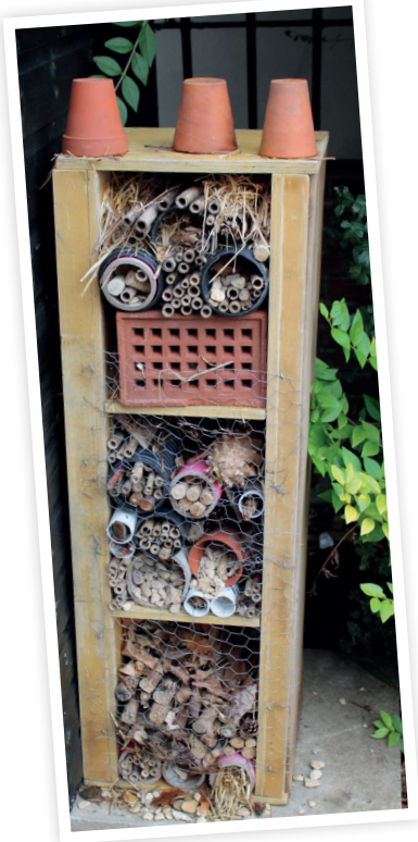
Bug Hotel, made by last year's Year 3 Gardening Club